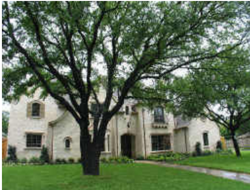
Click on Image for More Options

MLS# 10809444 Active 6423 STEFANI DR DALLAS* 75225-2328* LP: $1,850,000