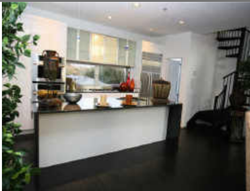
Click on Image for More Options

MLS# 10855880 Active 3110 OLIVER ST #C Dallas 75205 LP: $495,000