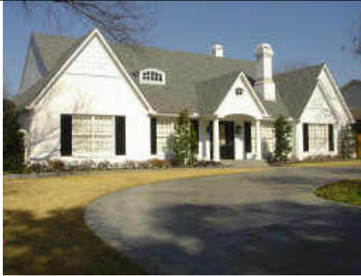
Click on Image for More Options

MLS# 10926365 $ Active 6715 LUPTON DR DALLAS 75225 LP: $1,389,000