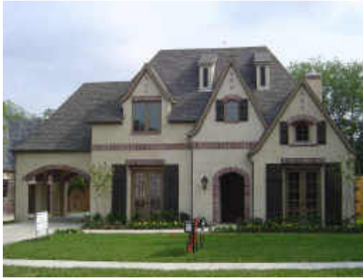
Click on Image for More Options

MLS# 10727455 Active 6715 PARK LN DALLAS* 75225-2709* LP: $1,249,000